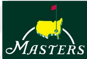
Congratulations to Danny Willett for his victory in the 2016 Masters